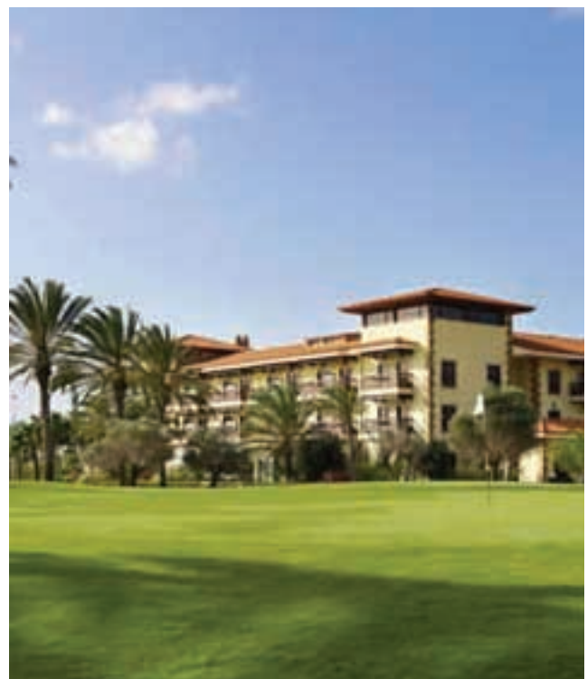
Elba Palace Hotel and Fuerteventura Golf

Click on the e-mail link to enquire: info@golfsunholidays.com