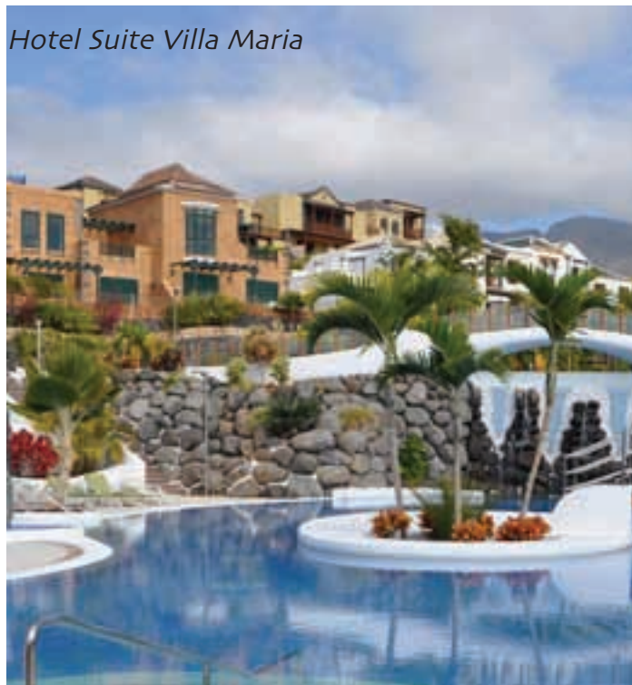
Hotel Suite Villa Maria

7 nights B&B, 3 rounds golf, ★★★★★: €707