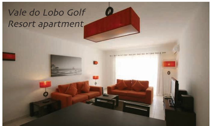
Vale do Lobo Golf Resort apartment