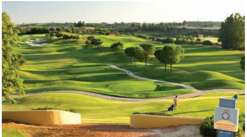
Montecastillo Golf Course