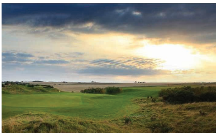
Top: Fairmont St Andrews, Above: 4th Hole on the Kittocks