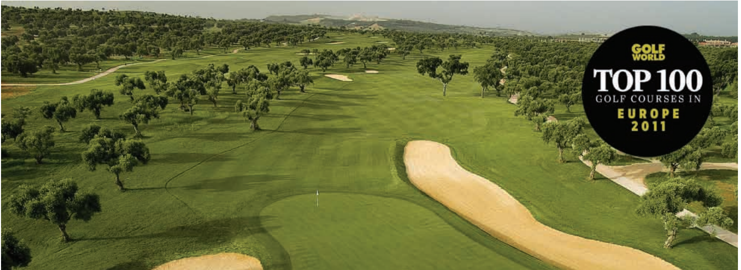
Above: Arcos Gardens Golf Club; Right: Fairway Gardens Townhouse; Left: Cortijo Hotel