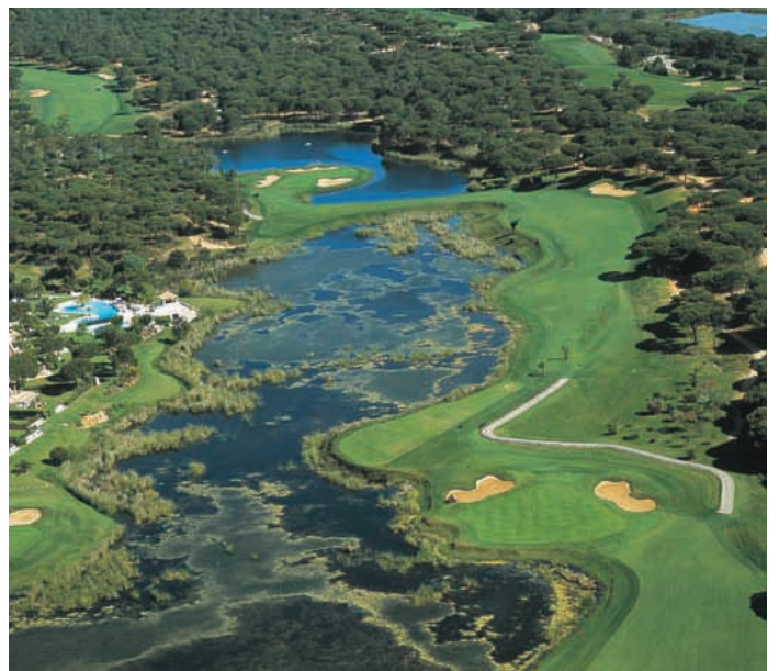
Dona Filipa Hotel and San Lorenzo Golf