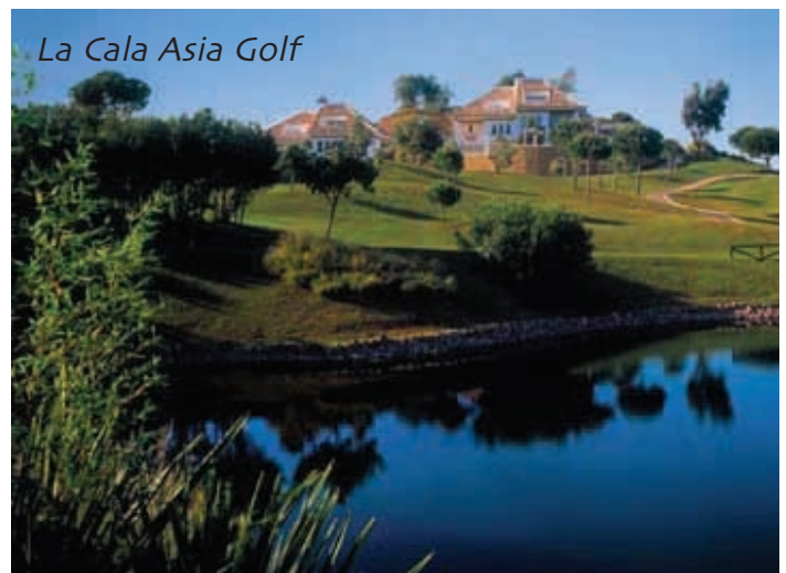
La Cala Asia Golf