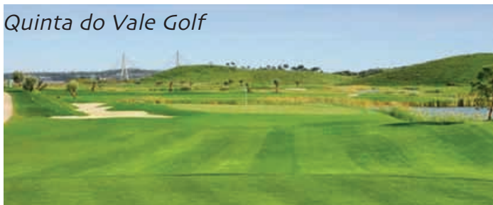
Quinta do Vale Golf