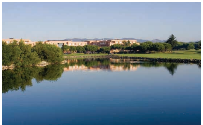
Quinta da Marinha Resort