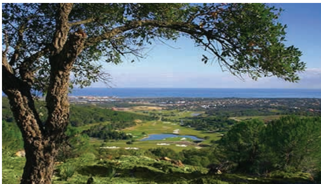
La Reserva Sotogrande