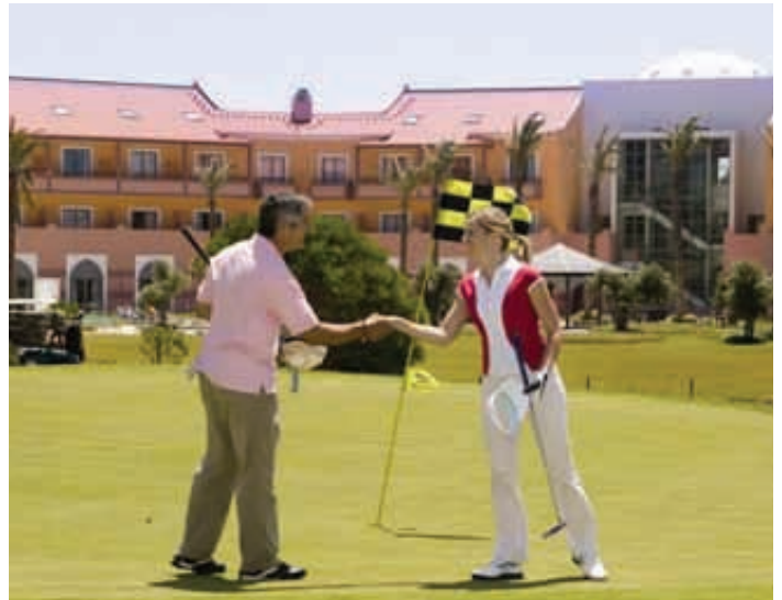
Pestana Sintra Golf Hotel and Beloura golf course.