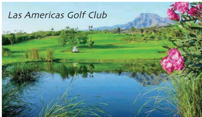
Las Americas Golf Club