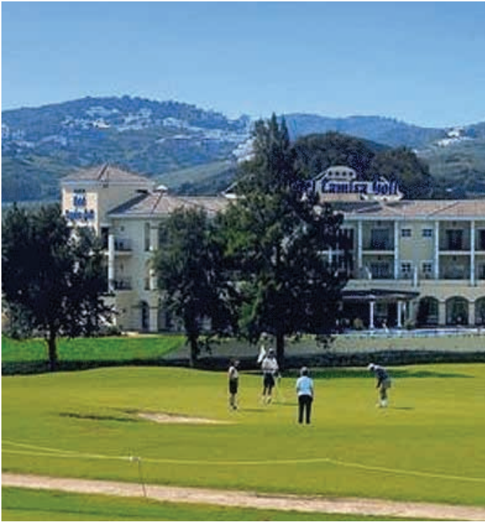
Hotel Tamisa Golf