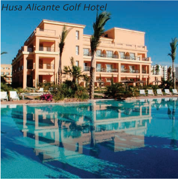
Husa Alicante Golf Hotel