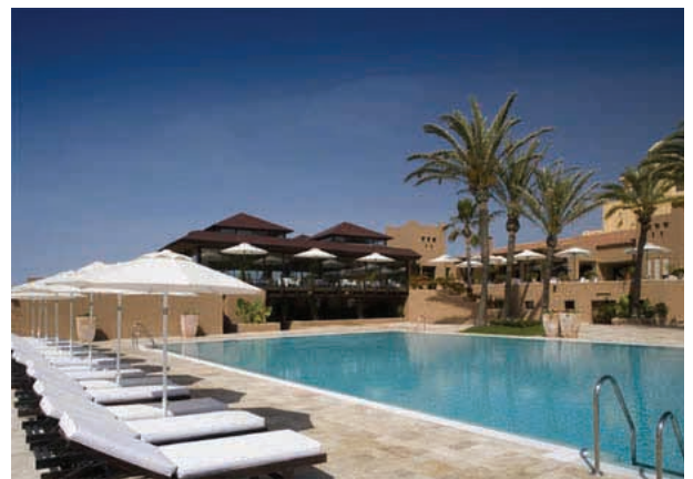
Above: Guadalmina Hotel and Golf