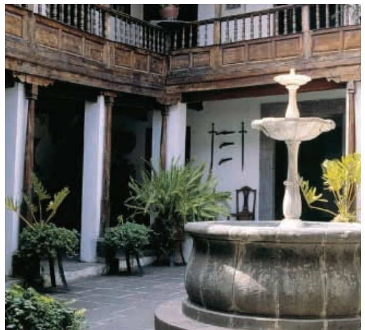
Hotel Rural Cortijo San Ignacio Golf