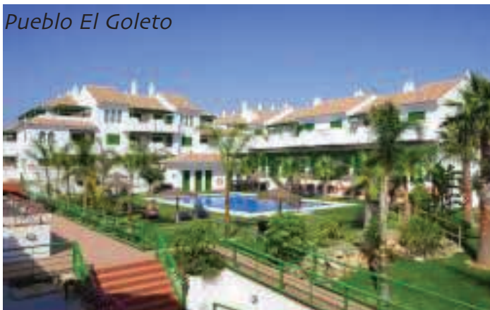
Pueblo El Goleto

7 nights accommodation in a fully equipped 1 bedroom apartment at Pueblo El Goleto Apartamentos (Urb. Duquesa Hills, Sabinillas-Manilva) on a self-catering basis, with unlimited golf including buggy for 2 persons on Doña Julia golf course , including free use of gym, mini spa (jacuzzi, steam room, sauna, aromatic showers), paddle courts, wi-fi in reception area, outdoor swimming pool, free private parking: Until 30 September 2013: 343 euros 1 Oct-15 November 2013: 385 euros 16 Nov - 31 Dec 2013: 343 euros