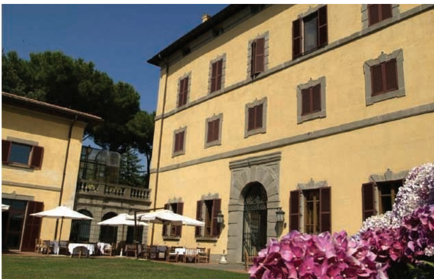
Castelgandolfo Hotel, located 15 km from the centre of Rome