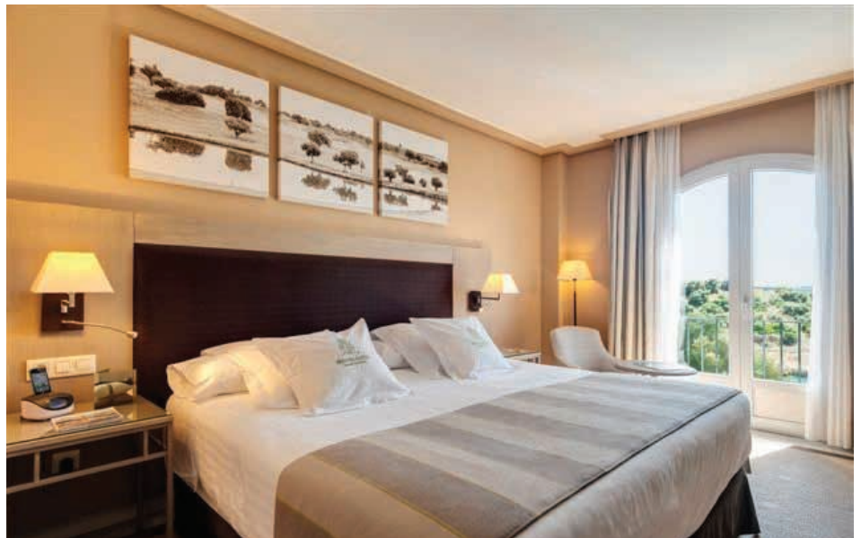
Recently refurbished room at Barcelo Montecastillo Hotel