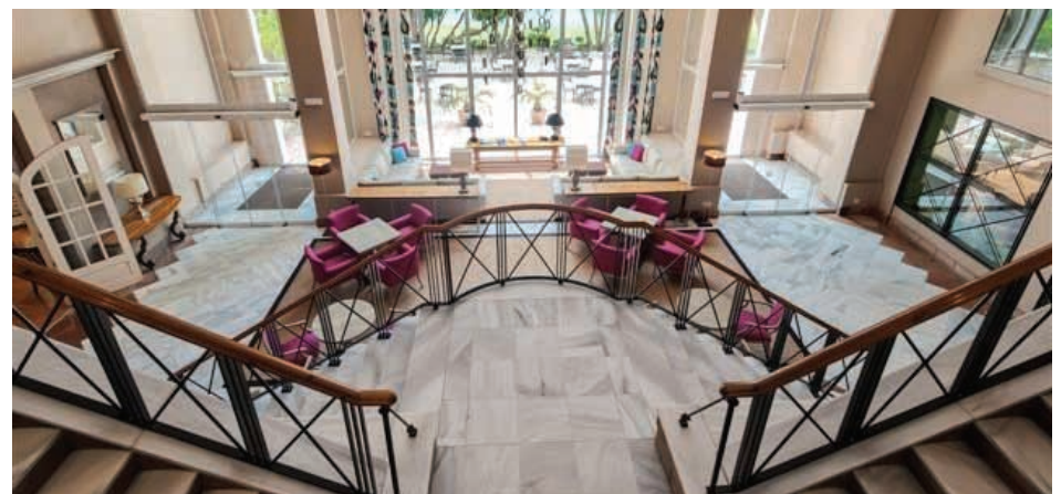
Barcelo Montecastillo Hotel