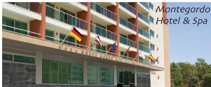
Montegordo Hotel & Spa