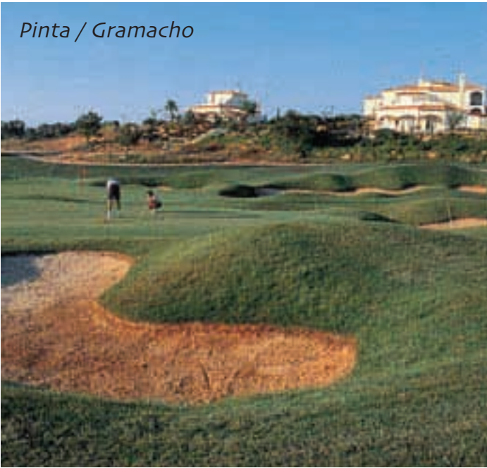
Pinta / Gramacho