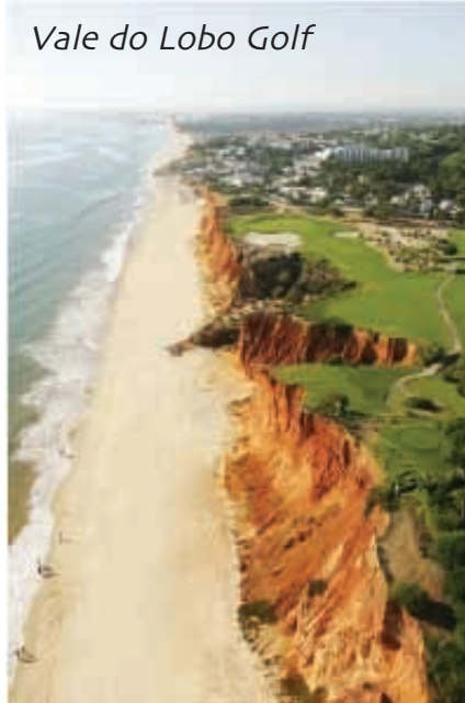
Vale do Lobo Golf

3 nights accommodation in a 1 bedroom or 2 bedroom apartment at the Vale do Lobo Golf Resort , breakfast daily, 2 rounds of golf on Vale do Lobo Resort and Ocean Courses , free use of VDL Tennis academy, sauna, steam bath, gymnasium, unlimited use of tennis courts, 10% discount