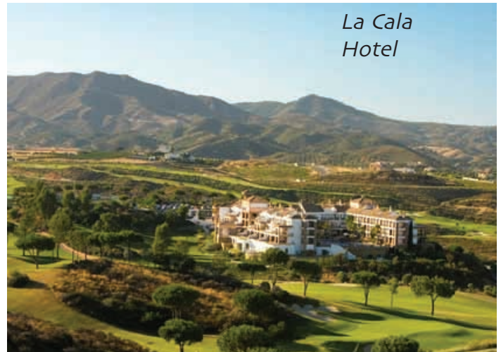
La Cala Hotel