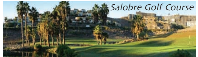
Salobre Golf Course