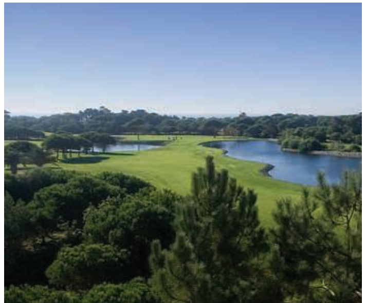
Quinta da Marinha golf course.